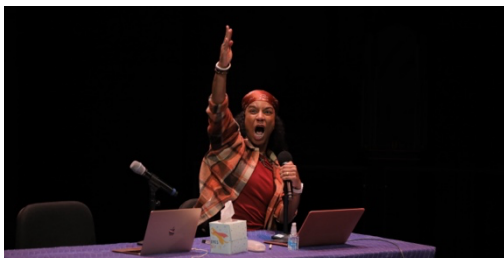
Arms Around America